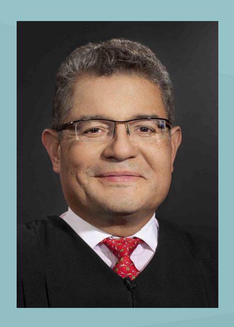
Hon. Ruben Castillo, Ret. U.S. District Court for the Northern District of Illinois